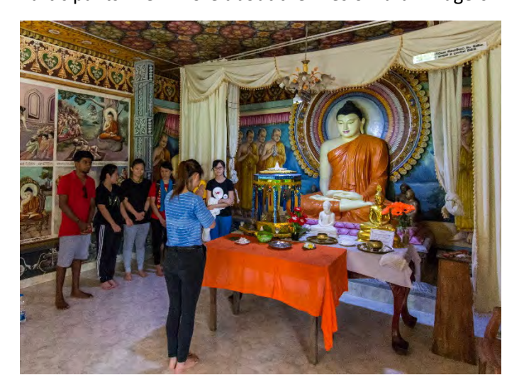
Participants visited a tranditional temple.