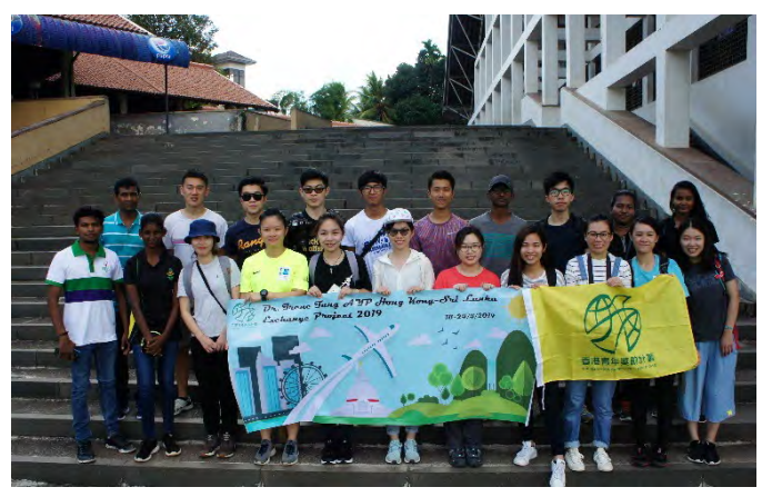
Local participants and leaders welcomed us at the airport.