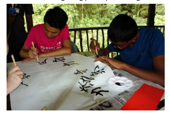
Participants learnt how to write their names in mutual languages.

Apart from visiting the natural habitat of Sri Lanka, participants also took part in different cultural activities like learning Chinese calligraphy and making Chinese Tang Yuan. Since April is the New Year month in Sri Lanka, Hong Kong participants taught them how to write Chinese characters and make 'Fai Chun'.