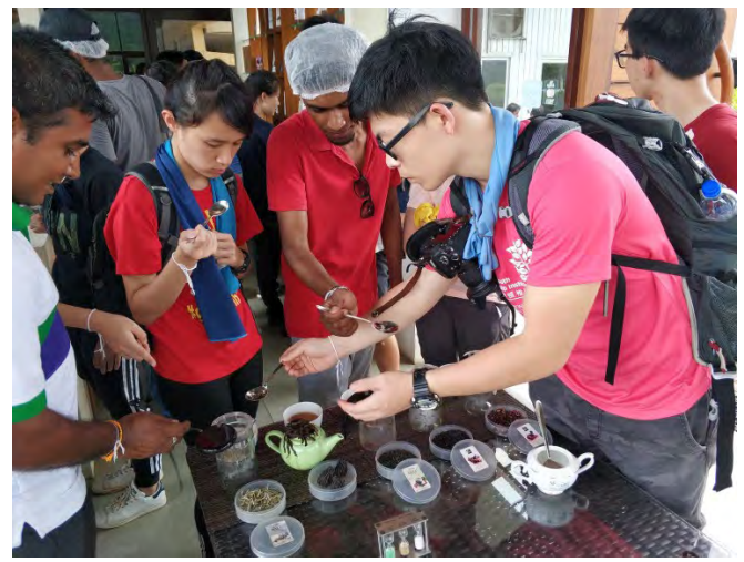
Everyone was could not wait to taste the famous Ceylon tea.