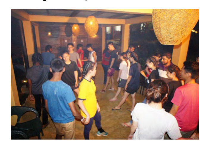
Everyone sang songs and danced together.

Getting along with one another for a week, everyone built friendship and got to know more the Sri Lanka culture. It's always hard to say goodbye for everyone. At the campfire session, HK participants gave their handmade souvenirs to the local people. They exchanged contacts and took photos together to record this unforgettable trip.