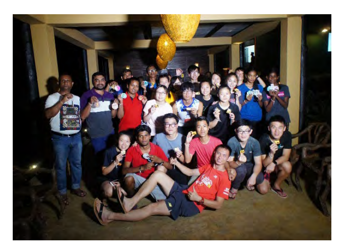
Participants exhanged souvneirs which marked the end of the trip.