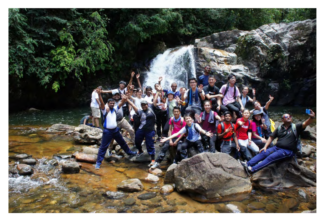
Everyone enjoyed the nice waterfall there!