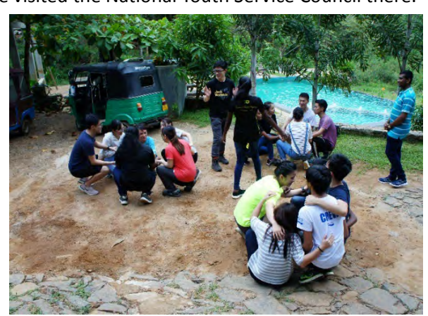
Participants got to know each through different ice-break games.

All participants explored the famous Sinharaja rainforest and admired the unique natural environment of Sri Lanka. They also visited the Lankagama rural village. Participants asked questions actively to know about the development of the rural village and lives of the villagers. Villagers showed us good hospitality and prepared various traditional food for us. In addition, participants got the chance to visit a traditional temple and tea factory. They learnt different tea type and understood how the well-known Ceylon tea was made. Every day was a fruitful for all of them.