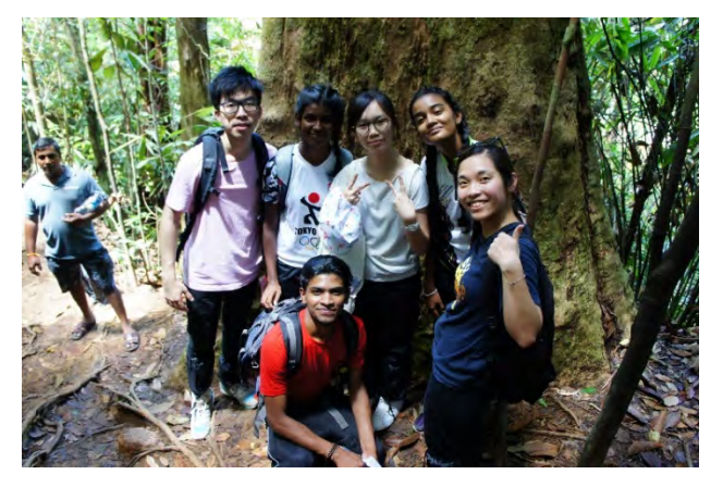
Participants were curious about the unique insect species in the rainforest.